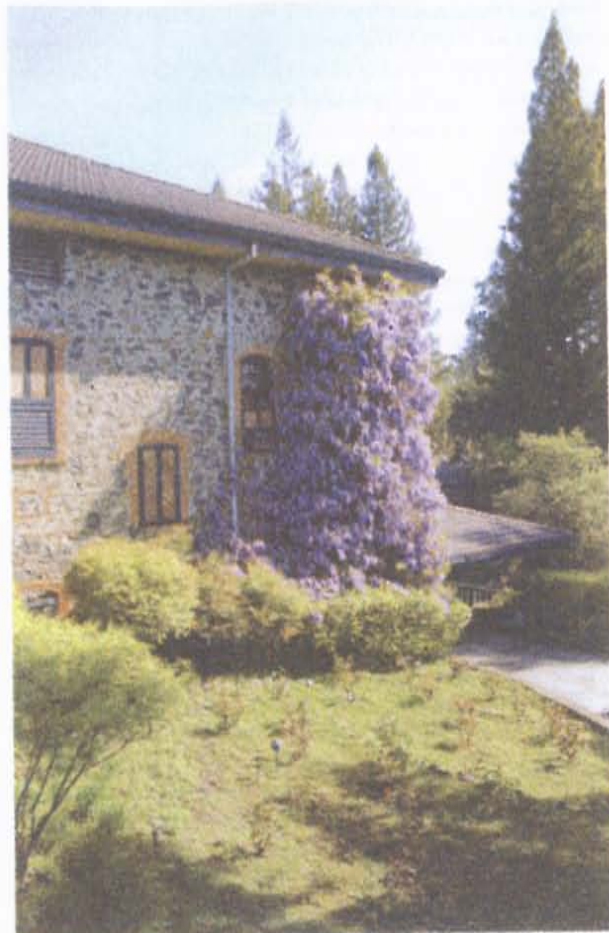
The historic Simi Winery has a great tour for novice wine travelers; it offers an extensive peek into and explanation of the inner workings of a winery.

may be seldom found on the retail shelves back home. The Unti family began growing grapes in 1990 and started making wine in 1997. The winery is utilitarian, and tastes are poured from a plywood counter topped by polished stainless steel, but the wines are authentic and passionately made. The Zinfandel is elegant in the classic Dry Creek Valley style, and the Grenache and Barbera are also not to be missed.