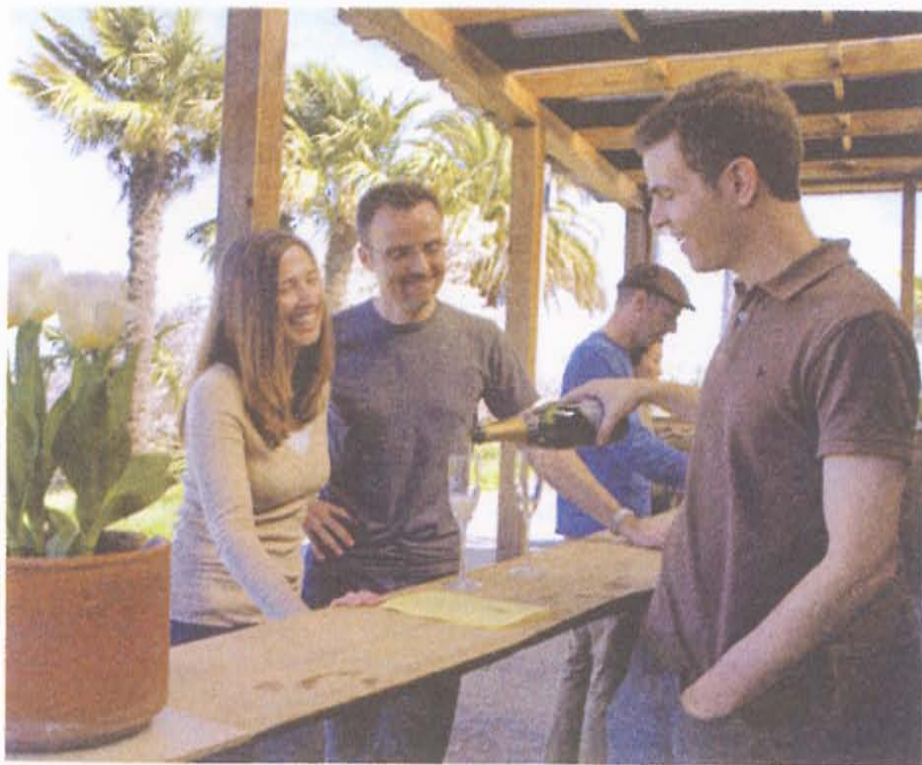
Iron Horse Vineyards boasts an outdoor tasting room, where visitors can take in the view of Green Valley while sipping their wines.

There's no better symbol for the history and evolution of the Sonoma wine industry than Seghesio. Founded by Italian immigrants before the turn of the 20th century, it pumped out jug wines for decades, before finding its footing in the 1980s with quality-wine production. Today, Seghesio consistently produces